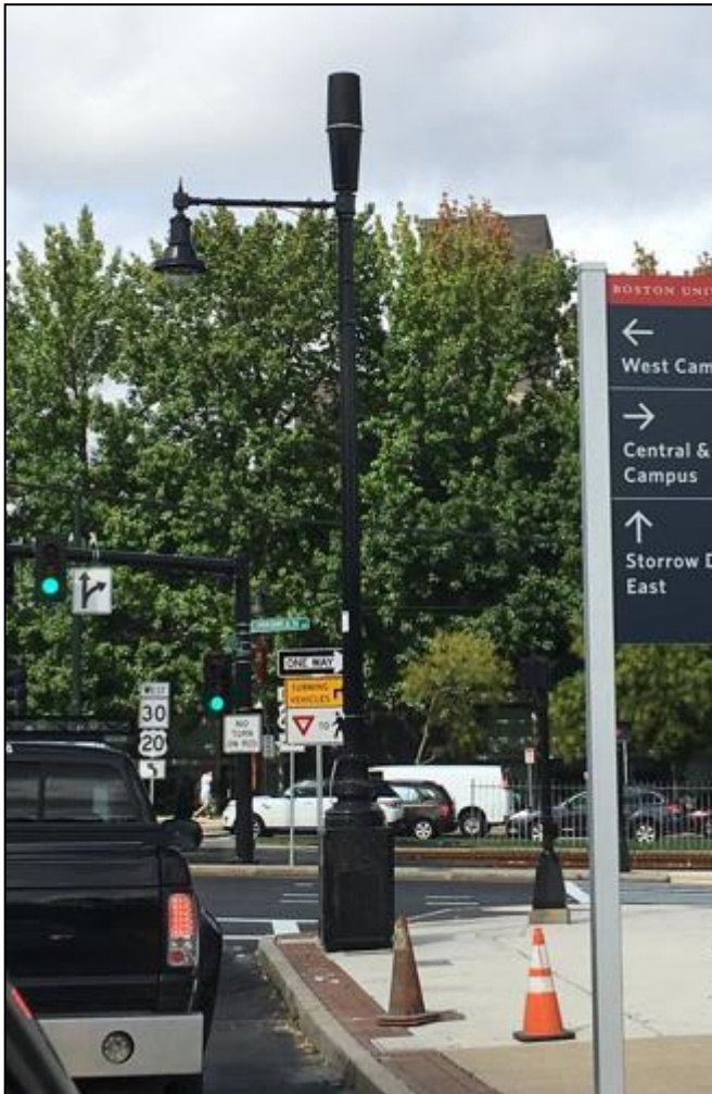
Figure 6: Base-mounted accessory equipment.

(1) Ground-Mounted Concealment. All ground-mounted equipment cabinets shall be placed six inches behind the sidewalk, at least two feet from the curb, and two feet from driveway and curb edges. Pedestals must be at least three feet from fire hydrants. Installations must leave a minimum horizontal clear space for the path of travel of at least six feet. The Director may require more clear space for travel in heavily used commercial areas to provide sufficient room for pedestrian traffic. On collector streets and local streets, the City prefers ground-mounted accessory equipment to be concealed as follows: (i) within a landscaped parkway, median or similar location, behind or among new/existing landscape features and painted or wrapped in flat natural colors to blend with the landscape features; and (ii) if landscaping concealment is not technically feasible, disguised as other street furniture adjacent to the support structure, such as, for example, mailboxes, benches, trash cans and information kiosks. On major streets outside underground districts, proposed ground-mounted accessory equipment