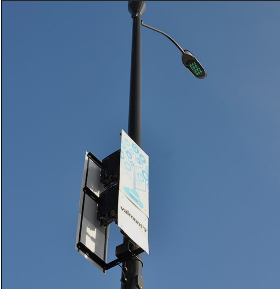
Figure 5: Accessory equipment concealed behind banners.

orientation would be technically feasible, the Director may select the most appropriate orientation.