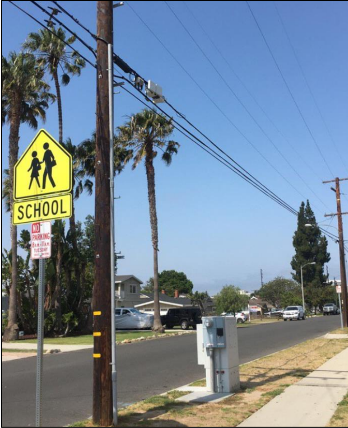
Figure 10: Strand-mounted wireless facility with a ground-mounted remote power source.