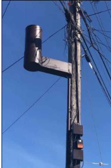
Figure 5: Shrouded, side-mounted antenna on wood utility pole to comply with CPUC horizontal separation requirements.