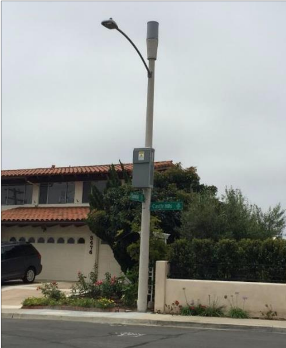
Figure 1: Antenna concealed within a single shroud (or radome) with a tapered cable shroud between the antenna and pole-top

(2) Antenna Volume. Each individual antenna associated with a single small cell shall not exceed three cubic feet. The cumulative volume for all antennas on a single small cell shall not exceed: (i) three cubic feet in residential areas; or (ii) six cubic feet in nonresidential areas. Notwithstanding the preceding sentence, the Director may grant an exception when the applicant demonstrates by clear and convincing evidence that compliance with this section would not be technically feasible.