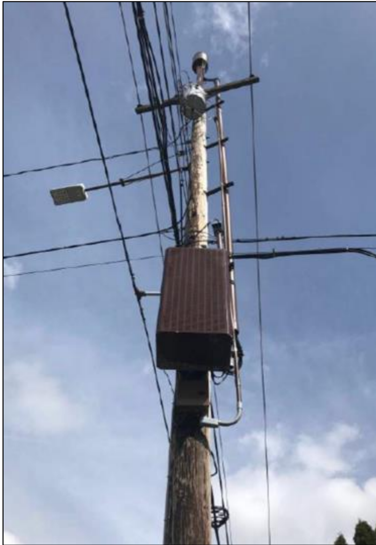
Figure 4: Pole-mounted accessory equipment shroud on a wood utility pole.

component to be placed less than eight feet above ground level, the clearance from ground level shall be no less than required for compliance with such laws.