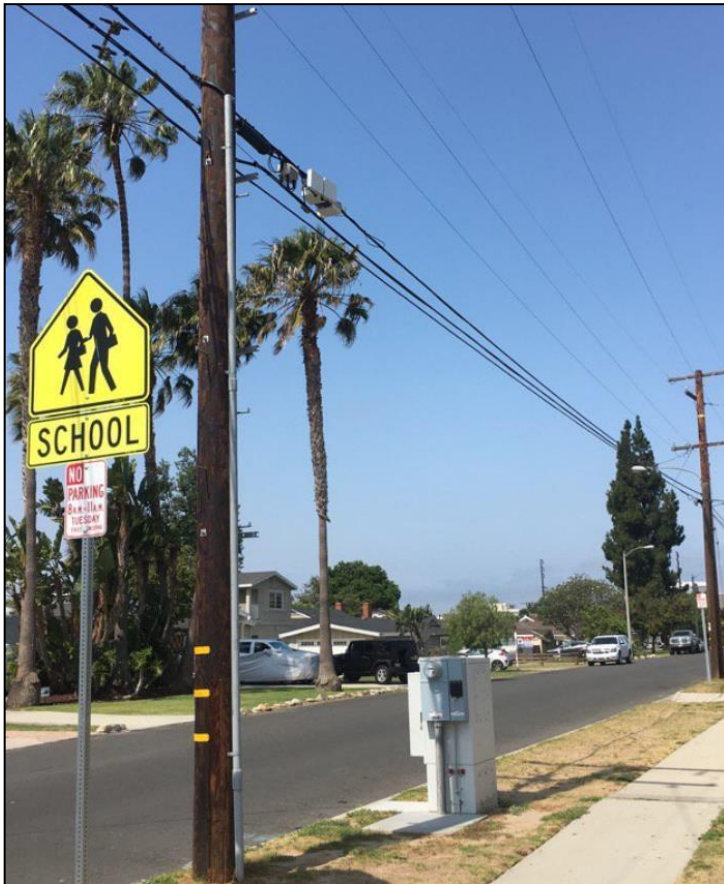
Figure 8: Strand-mounted wireless facility with a ground-mounted remote power source.

(n) Utilities. The provisions in this subsection (n) are applicable to all utilities and other related improvements that serve small wireless facilities and other infrastructure deployments.