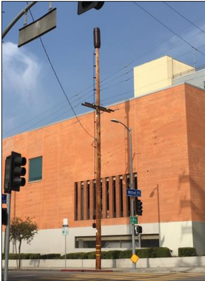
Figure 2: Pole-top antenna on a wood utility pole with tapered shroud.