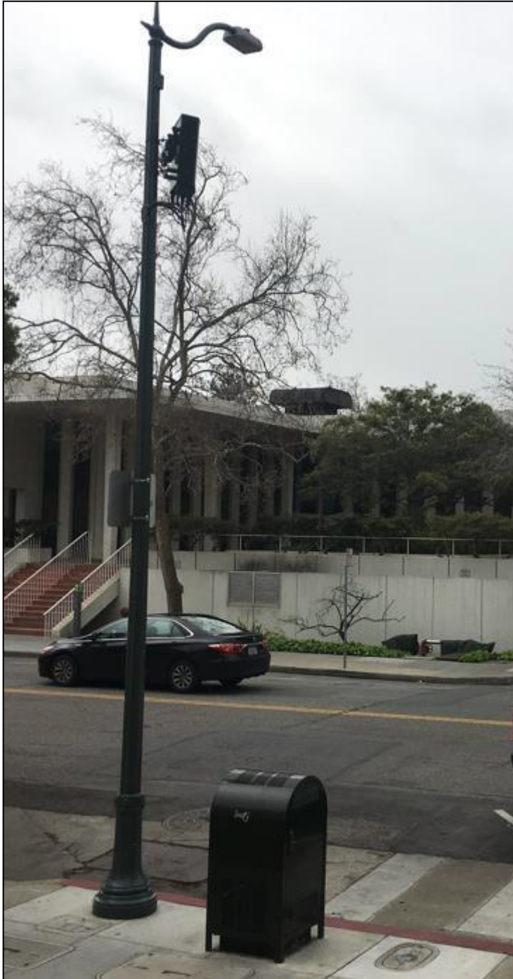
Figure 7: Ground-mounted accessory equipment concealed as a mailbox.

should be completely shrouded or placed in a cabinet substantially similar in appearance to existing ground-mounted accessory equipment cabinets.