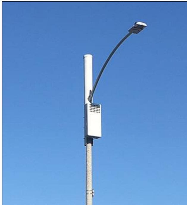
Figure 6: Flush-mounted radio shroud.