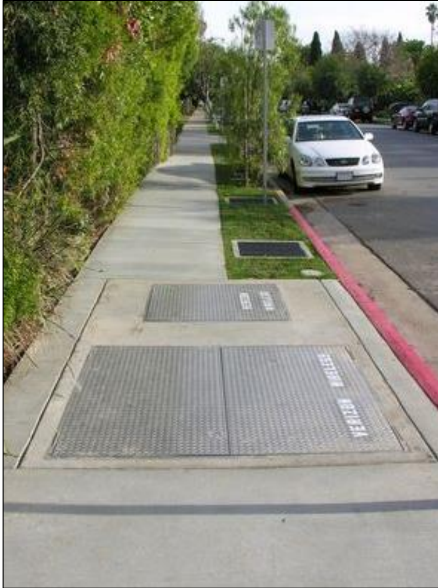
Figure 3: Flush-to-grade underground equipment vault.